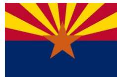
ARIZONA STATE FLAG

The Upcoming Agendas option allows you to find agendas for bills in upcoming committee meetings.